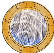
Deck 3 - FWD After Hours Chandelier