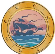
Deck 6/7/8 - MID Midship Elevator Elevator Mural