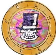
Deck 3 - MID French Quarter Lounge