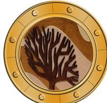
Deck 9 - Aft Cabanas