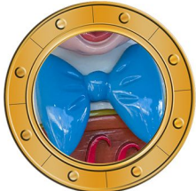
Deck 9 - MID Pinocchio's Pizzeria