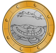
Deck 4 - Aft Animator's Palate Wall