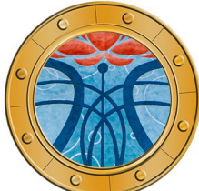
Deck 3 - MID Grand Hall Carpet