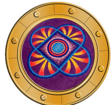
Deck 5 - MID Comet: Mickey's Mainsail - WhiteCaps