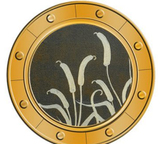
Deck 3 - Aft Tiara's Place Crooner's Piano