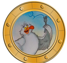
Deck 3 - MID Port Adventure Desk Mural