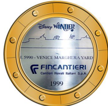
Deck 9 - FWD Starboard