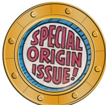
Deck 3 - FWD Captain British Comic Crown & Fin