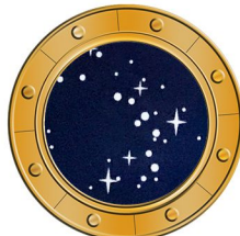
Deck 5 - MID Oceaneer Club Sign