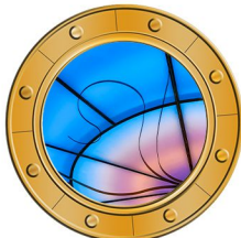
Deck 3 - MID Triton's Ceiling