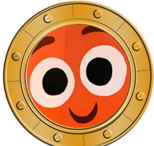
Deck 9 - AFT Dory's Reef

Find where these items are located around the ship and write down their location.