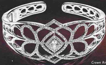
Crown Regal Collection