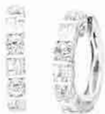
Crown of Light