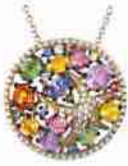
Watercolors Collection by EFFY