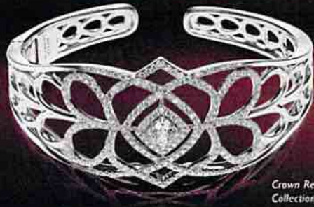
Crown Regal Collection