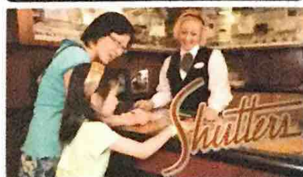
DECK 4, AFT