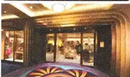
DECK 4, FORWARD