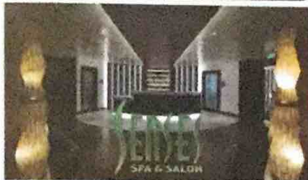
DECK 9, FORWARD Extension 7-1465