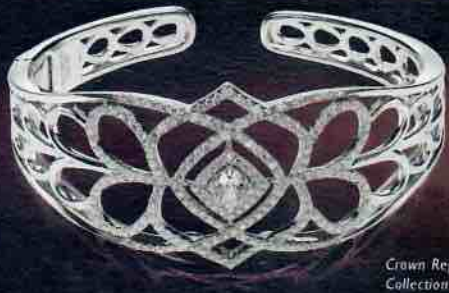
Crown Regal Collection