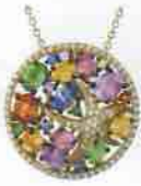
Watercolors Collection by EFFY