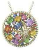
Watercolors Collection by EFFY