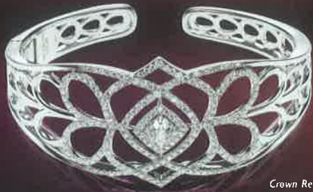
Crown Regal Collection