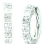
Crown of Light