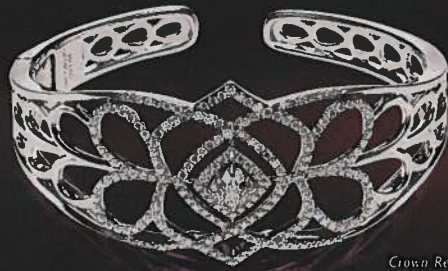
Crown Regal Collection