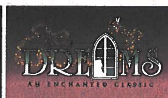
DISNEY DREAMS: AN ENCHANTED CLASSIC Walt Disney Theatre 6:00 pm & 8:30 pm

THURSDAY DAY AT SEA Attire: Cruise Casual