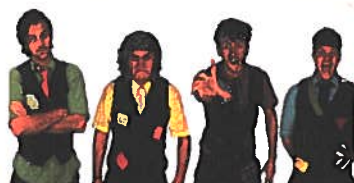
SHOWTIME: JUNNK Walt Disney Theatre 6:15 pm & 8:30 pm

TUESDAY GEORGE TOWN, GRAND All Ashore: 7:00 am All Aboard: 4:00 pm Attire: Formal