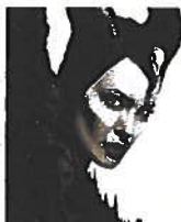
MALEFICENT: MISTRESS OF EVIL (PG) Walt Disney Theatre 5:30 pm & 8:30 pm

SATURDAY PANAMA CANAL Attire: Semi Formal