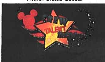
CREW TALENT SHOW Walt Disney Theatre 6:15 pm & 8:30 pm

WEDNESDAY COZUMEL, MEXICO All Ashore: 10:00 am All Aboard: 6:15 pm Attire: Cruise Casual