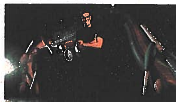
SHOWTIME: JEFF CIVILLICO Walt Disney Theatre 6:15 pm & 8:30 pm

SUNDAY CARTAGENA, COLOMBIA All Ashore: 9:00 am All Aboard: 5:15 pm Attire: Cruise Casual