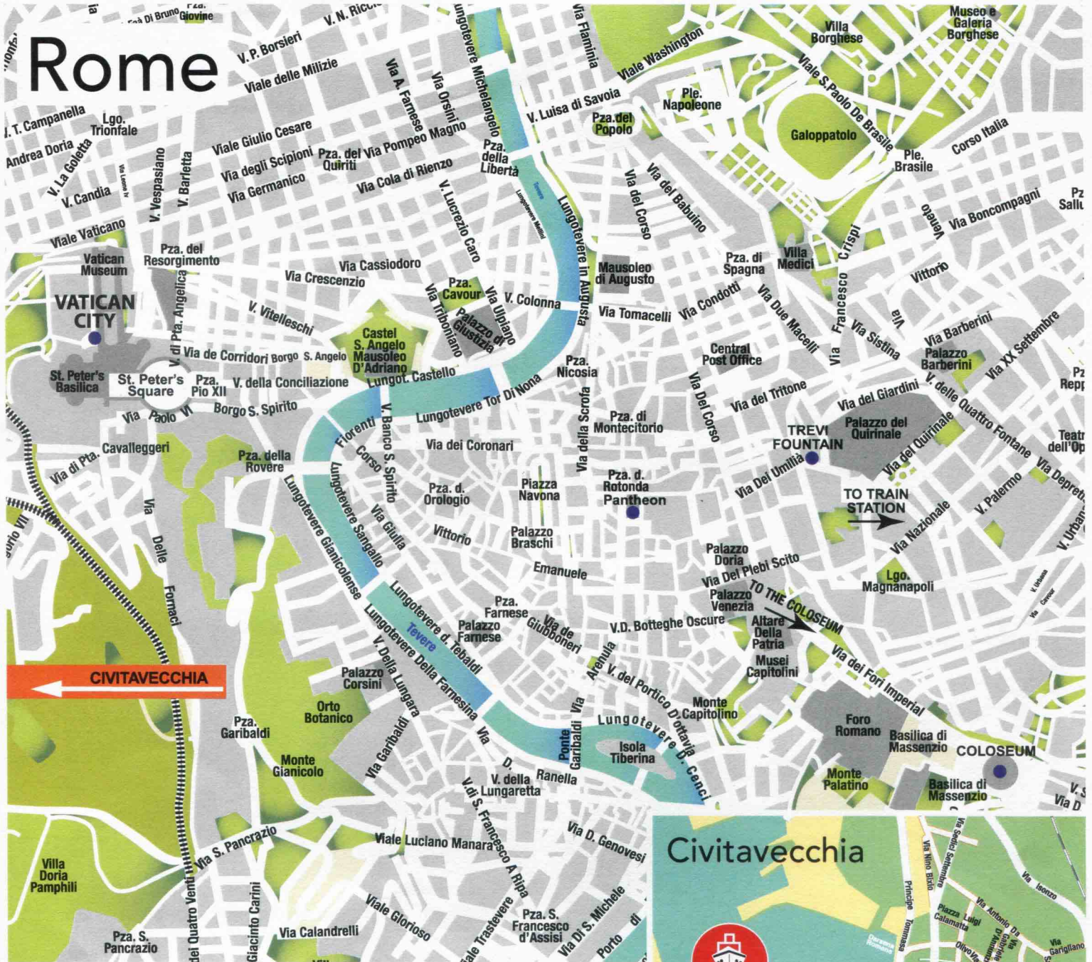
Rome/Civitavecchia DNS 04/05/2019