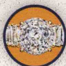
Crown of Light