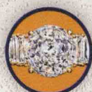
Crown of Light