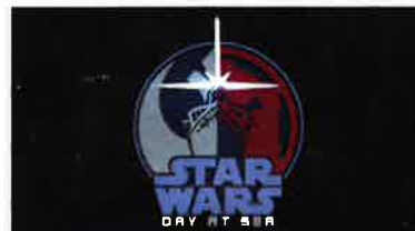
SUMMON THE FORCE Deck 11 Stage 10:15 pm

DAY AT SEA Attire: Star Wars or Cruise Casual