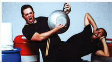
SHOWTIME: REPERCUSSION Walt Disney Theatre 6:15 pm & 8:30 pm

ROAD TOWN (TORTOLA), B.V.I. All Ashore: 7:30 am All Aboard: 5:45 pm Attire: Pirate or Cruise Casual