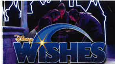
DISNEY WISHES Walt Disney Theatre 6:15 pm & 8:30 pm