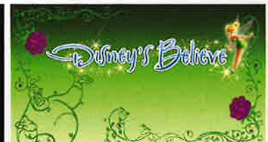
DISNEY'S BELIEVE Walt Disney Theatre 6:15 pm & 8:30 pm

DISNEY CASTAWAY CAY All Ashore: 9:30 am All Aboard: 4:45 pm Attire: Cruise Casual