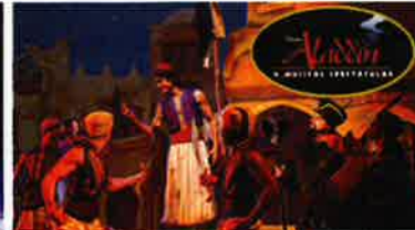
DISNEY'S ALADDIN Walt Disney Theatre 1:00 pm, 6:15 pm & 8:30 pm