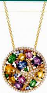
Multi-color Sapphire and Diamond Pendant set in 14K Gold