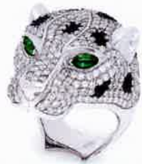
Signature Diamond and Emerald Panther Ring set in 14K White Gold