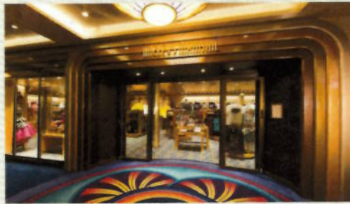
DECK 4, FORWARD