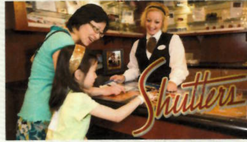
DECK 4, AFT