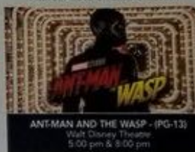
ANT-MAN AND THE WASP - (PG-13) Walt Disney Theatre 5:00 pm & 8:00 pm

NASSAU All Ashore: 9:30 am All Aboard: 5:15 pm Attire: Pirate or Cruise Casual