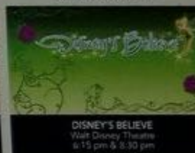
DISNEY'S BELIEVE Walt Disney Theatre 6:15 pm & 8:30 pm

DISNEY CASTAWAY CAY All Ashore: 8:30 am All Aboard: 4:45 pm Attire: Cruise Casual