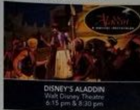
DISNEY'S ALADDIN Walt Disney Theatre 6:15 pm & 8:30 pm

PORT CANAVERAL Port Departure: 5:00 pm All Aboard: 3:45 pm Attire: Cruise Casual