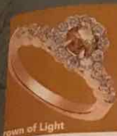
Crown of Light