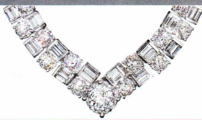
Crown of Light