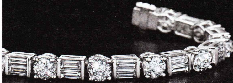
Crown Couture Collection