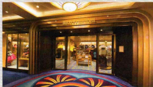
DECK 4, FORWARD