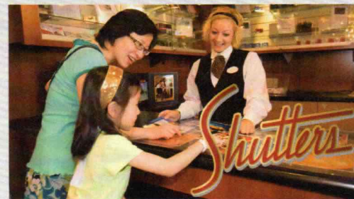
DECK 4, AFT