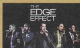
THE EDGE EFFECT