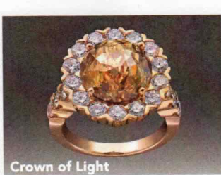
Crown of Light