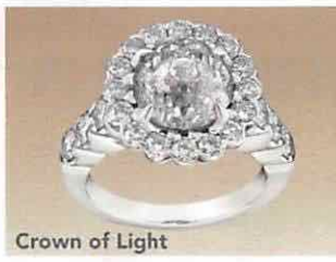
Crown of Light