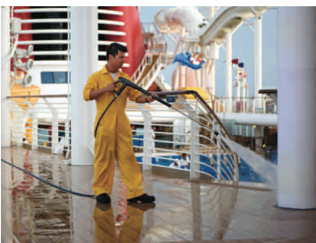
Condensation from the ships' onboard air conditioning units is recycled to supply fresh water and used to clean the outer decks of the ships.