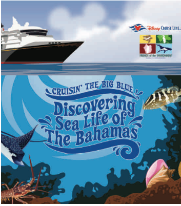
Local Bahamian schools use Disney Cruise Line activity booklets to learn more about native species.