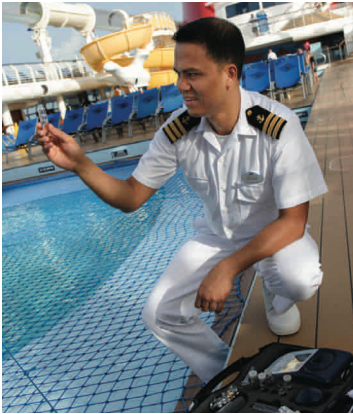
Environmental Officers aboard Disney ships are responsible for monitoring water quality, in addition to other duties.