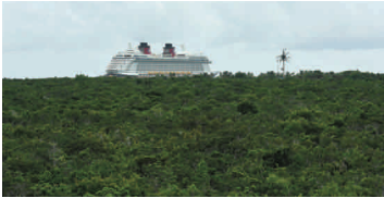
The vast majority of Disney's private island, Castaway Cay, remains in an undeveloped, preserved state.