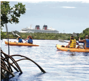
Guests on Castaway Cay participate in Port Adventures that foster an appreciation of the natural habitat.