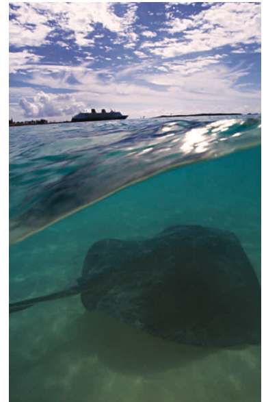
Native species, such as stingrays, enjoy the waters of Disney's private island, Castaway Cay.