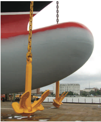
The design of the ships' bulbous, along with an innovative, 100 percent non-toxic hull coating, are both effective at reducing resistance in the open water and increasing fuel efficiency.