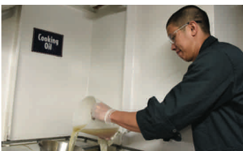
Each week, more than 1,000 gallons of used cooking oil is offloaded and recycled.

At Disney Cruise Line, we are dedicated to minimizing our impact on the environment through efforts focused on utilizing new technologies, increasing fuel efficiency, minimizing waste and promoting conservation worldwide. We strive to instill positive environmental stewardship in our cast and crew members and seek to inspire others through programs that engage our guests and the communities in our ports of call.