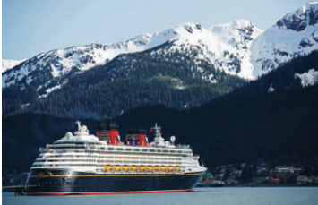
Disney Cruise Line complies with all water and air quality standards.