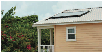
Disney Cruise Line utilizes solar power on Castaway Cay to heat water for crew areas.