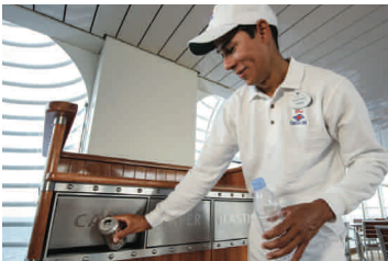
Disney Cruise Line crew members are careful to sort recyclables into waste receptacles.