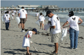
Disney VolunTEARS clear trash from the Brevard County coastline as part of regular beach cleanups.