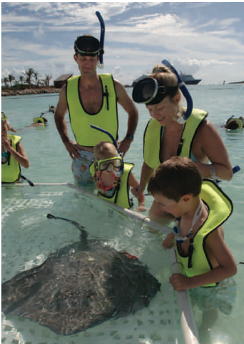
Families can learn about stingrays during hands-on experiences.