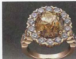
Crown of Light