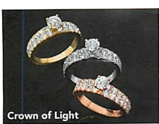
Crown of Light