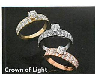
Crown of Light