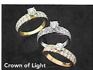
Crown of Light