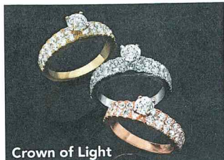
Crown of Light