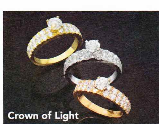
Crown of Light