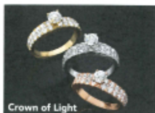
Crown of Light