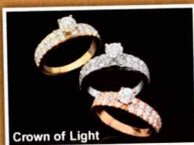
Crown of Light