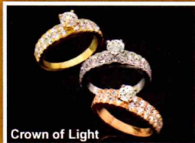
Crown of Light