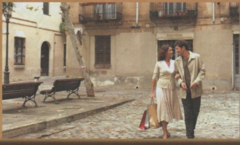
Photo ID and Key to the World Card as well as Cash and/or Credit Cards. Do you have your VIP cards?