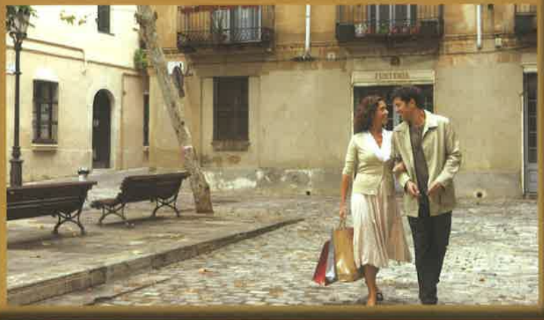
Photo ID and Key to the World Card as well as Cash and/or Credit Cards. Do you have your VIP cards?