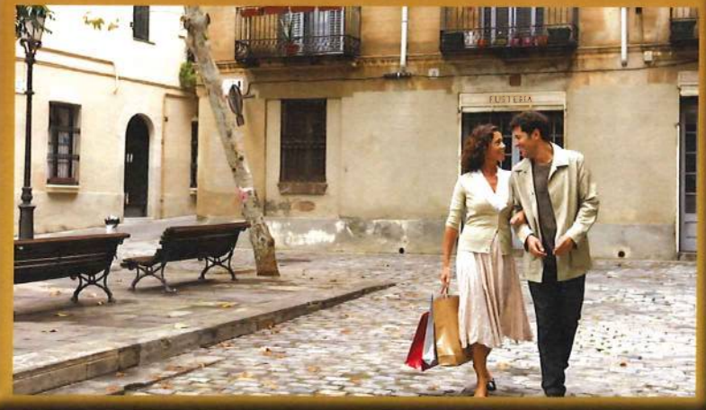
Photo ID and Key to the World Card as well as Cash and/or Credit Cards. Do you have your VIP cards?