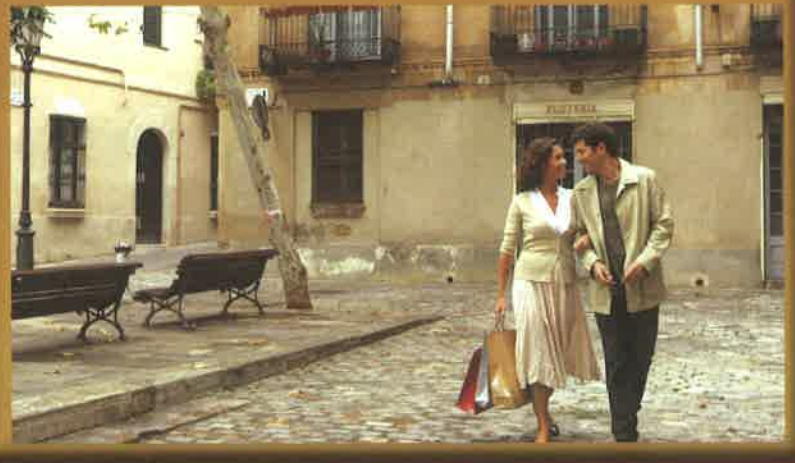
Photo ID and Key to the World Card as well as Cash and/or Credit Cards. Do you have your VIP cards?