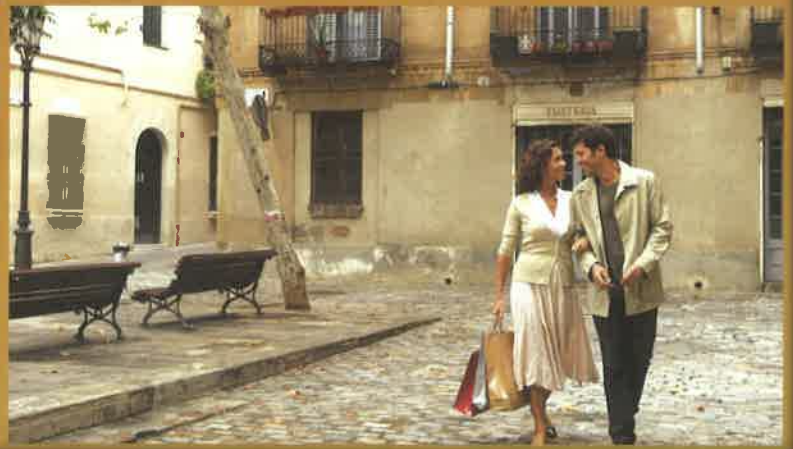
Photo ID and Key to the World Card as well as Cash and/or Credit Cards. Do you have your VIP cards?