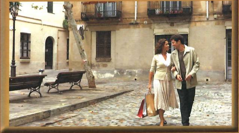
Photo ID and Key to the World Card as well as Cash and/or Credit Cards. Do you have your VIP cards?