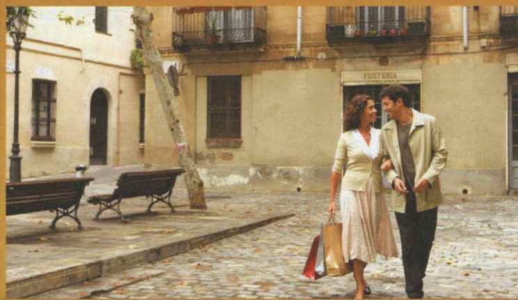
Photo ID and Key to the World Card as well as Cash and/or Credit Cards. Do you have your VIP cards?