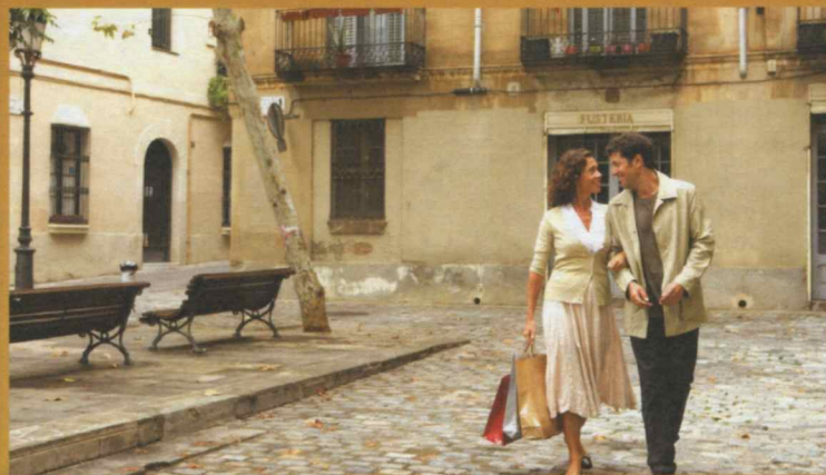
Photo ID and Key to the World Card as well as Cash and/or Credit Cards. Do you have your VIP cards?