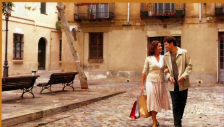
Photo ID and Key to the World Card as well as Cash and/or Credit Cards. Do you have your VIP cards?