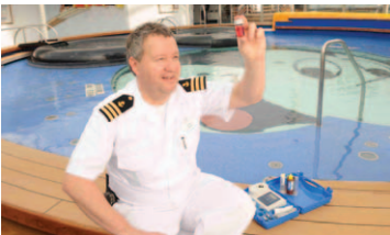
Environmental Officers aboard Disney ships are responsible for monitoring water quality, in addition to other duties.