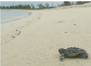
Loggerhead sea turtles are protected on Castaway Cay.