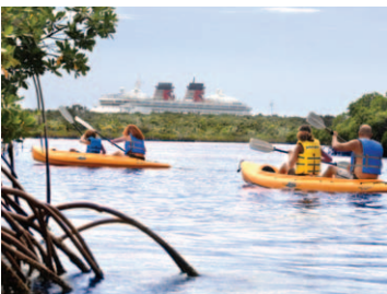
Guests on Castaway Cay participate in a Port Adventure that fosters an appreciation of the natural habitat.