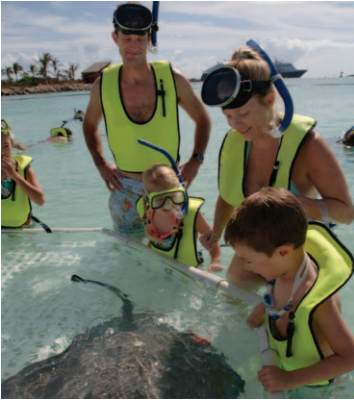
Families can learn about stingrays during hands-on experiences.