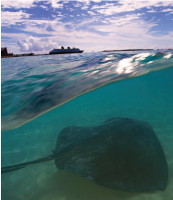
Native species, such as stingrays, enjoy the waters of Disney's private island, Castaway Cay.

Contact: Disney Cruise Line Media Relations http://www.dclnews.com