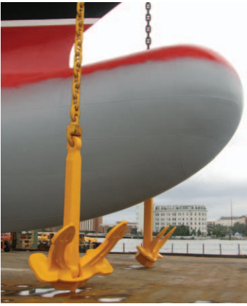
Our innovative hull coating is both 100 percent non-toxic and effective in increasing fuel efficiency by reducing surface resistance in open water.