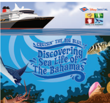
Local Bahamian schools use Disney Cruise Line activity booklets to learn more about native species.