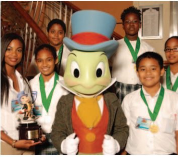
Children in Disney Cruise Line ports of call take part in environmental education programs, such as Disney Planet Challenge.