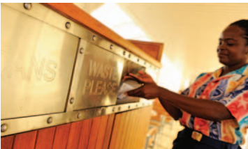
Disney Cruise Line crew members are careful to sort recyclables into waste receptacles.

At Disney Cruise Line, we are dedicated to minimizing our impact on the environment through efforts focused on utilizing new technologies, increasing fuel efficiency, minimizing waste and promoting conservation worldwide. We strive to instill positive environmental stewardship in our cast and crew members, and seek to inspire others through programs that engage our guests and the communities in our ports of call.