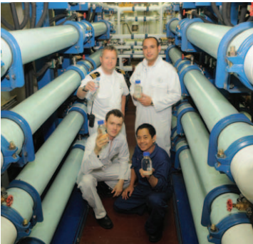
All Disney Cruise Line ships are equipped with Advanced Wastewater Purification Systems.