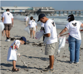
Disney VolunteARS clear trash from the Brevard County coastline as part of the International Coastal Cleanup.