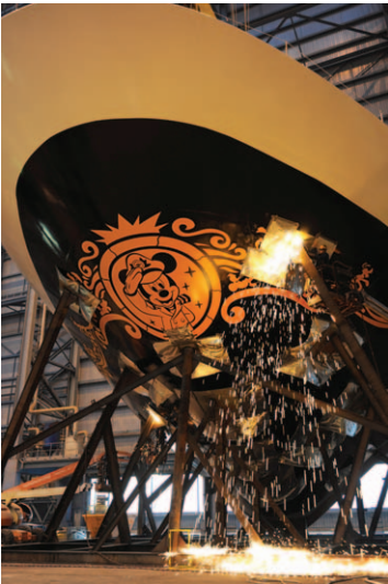
Construction materials, such as flooring and carpet, are made from sustainable, organic and recyclable alternatives.