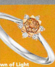
Wn of Light